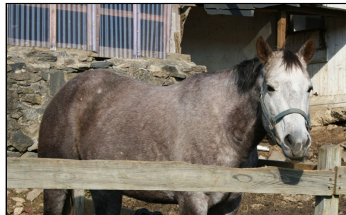
Violet spends a late fall day in the pasture.