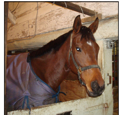
Star enjoys some downtime in her stall.