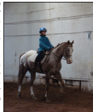
DaVinci is a favorite in the lesson program.

Both Fannie and DaVinci have quickly become favorites on the lesson program. Look for both of them this summer at the shows.